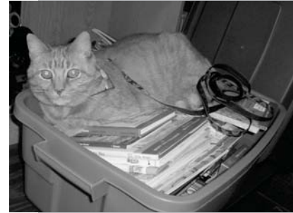
Oliver, our feline mentor, takes a break while returning books to the office with his Volunteer Coordinator at Carrollton Elementary School.